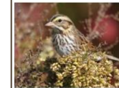
Savannah Sparrow - Threatened