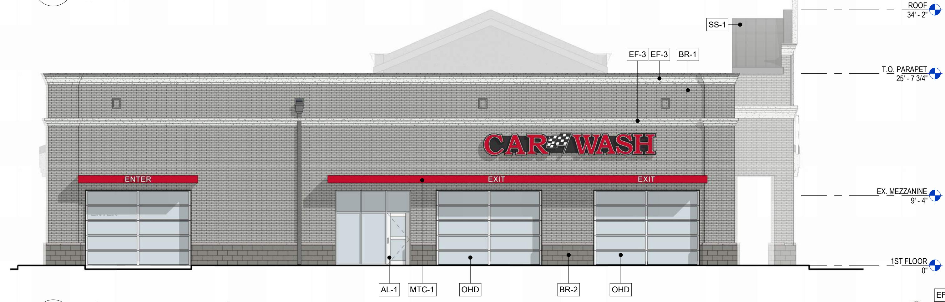
2 NORTH ELEVATION 1/8" = 1'-0"