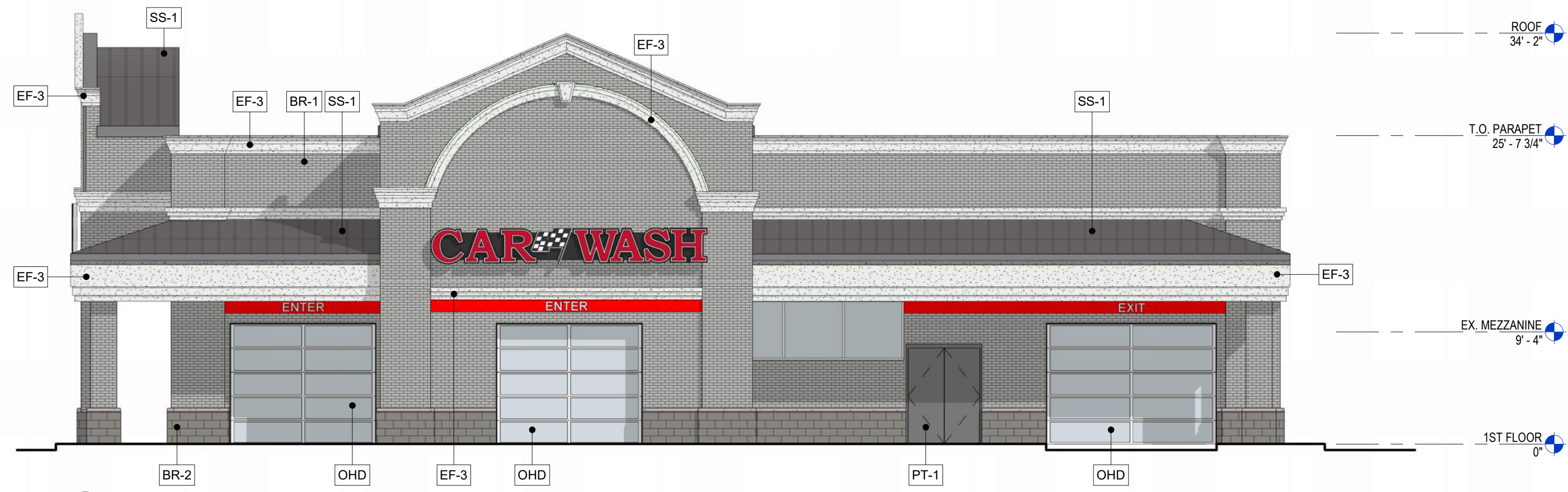
4 SOUTH ELEVATION 1/8" = 1'-0"